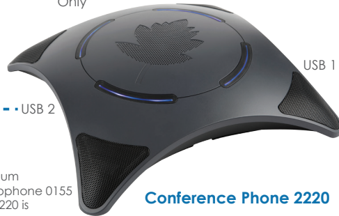
Conference Phone 2220

The recommended minimum distance between a Microphone 0155 and Conference Phone 2220 is at least 1.2m (4').